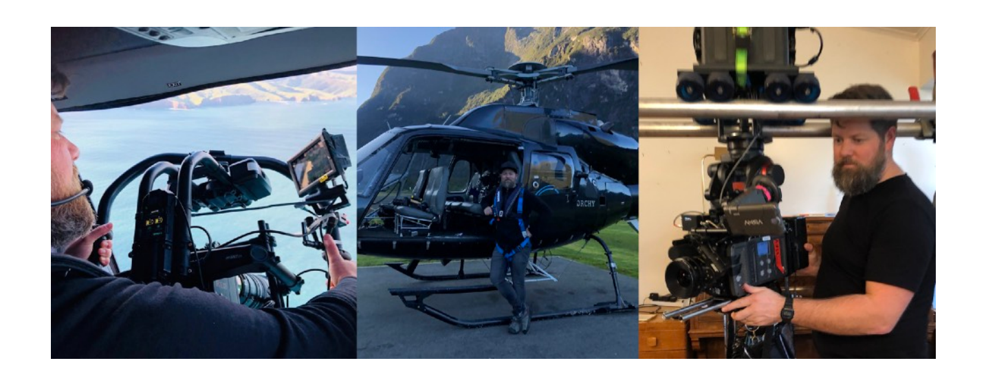
Showreel & Clips can be found at my website: kirkpflaum.co.nz